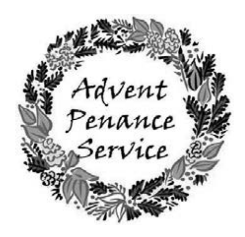
Monday, December 22<sup>nd</sup> <u>7:00 to 8:00pm</u>

Advent is a season of vigilance and watchfulness before the celebration of Christmas. Don't miss the opportunity to be reconciled to God and be at peace with all mankind.