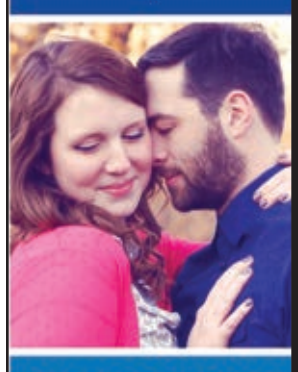
Catholic Match.com/ datePA