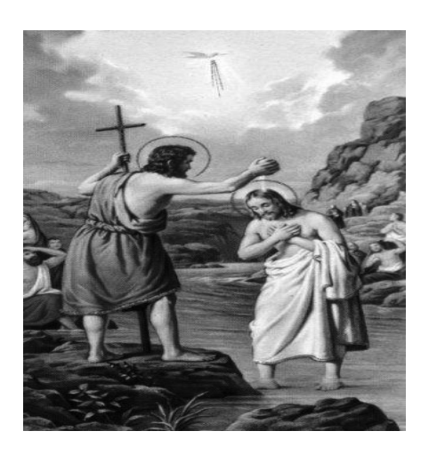
The Baptism of the Lord