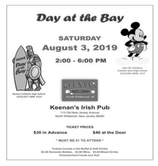
$30.00 AVAILABLE TO AUGUST 1st

On Saturday, June 29th after the 4:00pm Mass we will have a picnic in the school hall. There will be hot dogs and baked beans, ice tea and water. You may bring your own dessert. All are welcome.