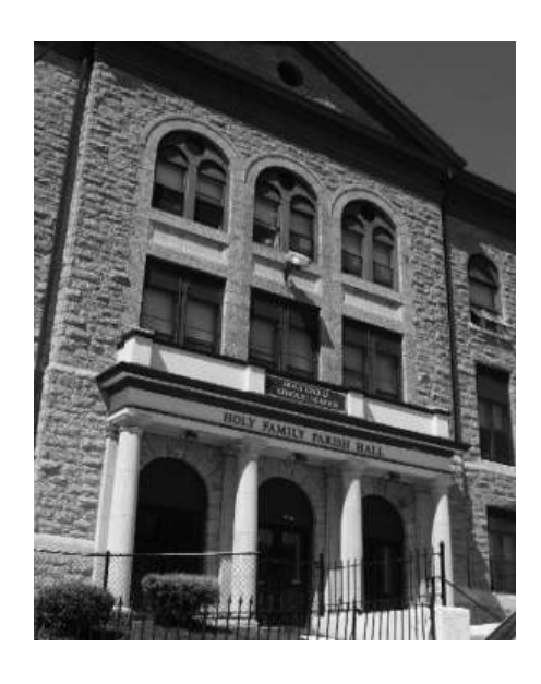
August 22, 2023 Dear Parishioners,

I would like to bring to you up to date on the status of the parish hall, which relates to the entire school. It has been a project of the Parish Pastoral Council to sell the under used school for over five years. We finally got an offer a year ago this August., but we are still waiting for a settlement date. In the meantime, we have developed maintenance problems with the roof of the school. The cost of the repairs is over $200,000. We do not have savings to begin to cover any part of that expense. The building has not been used a school for a dozen years. No part of the structure can be used as of the latest rain storms for any purpose. We will have to make use of our other buildings, such as the Annex for meeting space. I wish that I didn't have to bring troubling news about the parish. Since we cannot fix the school, we have to sell it. The money from the sale will help pay our operating expenses. The parish strength depends upon the willingness of its parishioners to sacrifice, which you have done many times over and over.