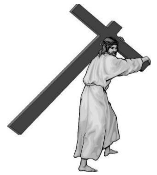
Stations of the Cross

Each Wednesday through Lent 7:00pm Feb. 21 and 28 March 6, 13, 20, and 27