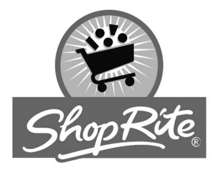
Shop Rite check came in for $45.05! Please drop receipts in the silver can in the entrance from Fowler Street.

For more information and to register, contact the Vocation Office at 610-667-5778 or visit https://heedthecall.orr/events/bbvc/